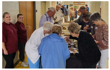
District 5 annual meeting Barbecue Luncheon